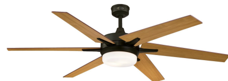
Reversible Cherry Finish Blades